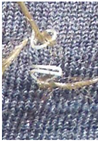
Fig. 7 LED legs twisted and sewn with conductive yarn

into rings with pliers. The LEDs are then connected to each other with conductive yarn that is sewn into the rings (fig. 7) connecting the LEDs in a combination of series and parallel circuits.