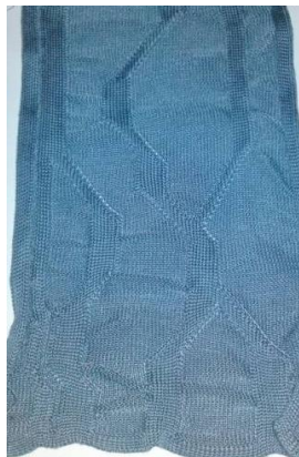
Fig. 5 Initial knitted sample of vertical, diagonal and horizontal channels

tubular knitted horizontal channels and vertical channels that were knitted using high and low butts with alternate tubular knitting. This innovative stitch (fig. 5) allows for the circuit to run through the fabric. The channels would need to have varying openings for different components, such as the switch, circuit board etc to be connected to the wiring. This meant that the final fabric was to be a very time consuming and intricately knitted piece. The initial plan was to ensure the skirt would be made from this one piece of fabric that wrapped around the body. However, machine width restrictions meant that a separate panel had to be inserted down the back.