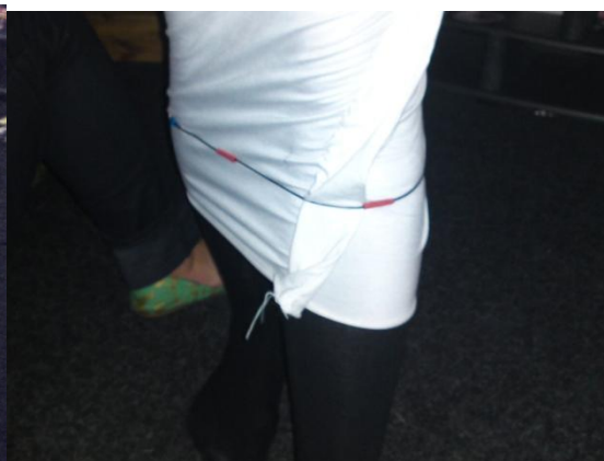
Fig. 2 Sensor placed at front of skirt

The sensor was tacked onto a toile of the final skirt to test the stretch. The red seals were also anchored with a few stitches to stop the wire from stretching and ensure that only the sensor stretched.