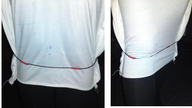
Fig. 3 Sensor is pulled tauter around the front of the skirt

For the sensor to stretch by 3cm, the sensor had to lay completely taut against the knees, to create enough tension for the required amount of stretch.