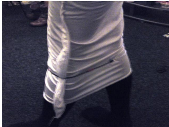
Fig. 1 Sensor placed at side of skirt

2. It seemed logical to place the sensor around the knees, as there would be more distance created in between the knees than around the thighs. There is obviously more distance created between the ankles, but this distance is not usually as consistent. Development was then needed in terms of which side of the skirt the sensor should be placed and also how slack the sensor needed to be for it to stretch 3cm when the wearer walked. Initial experimentation-