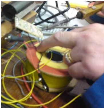
Fig. 8 Switch soldered onto circuit board

The switch, 9v battery connector and circuit board connected to the circuit through wiring. The switch, battery and circuit board all needed to sit in a pocket that took the weight of the components to ensure the wiring would not weaken. The folded internal pocket is not visible from the exterior and sealed by 2 large poppers, so the clean aesthetic is not interrupted.